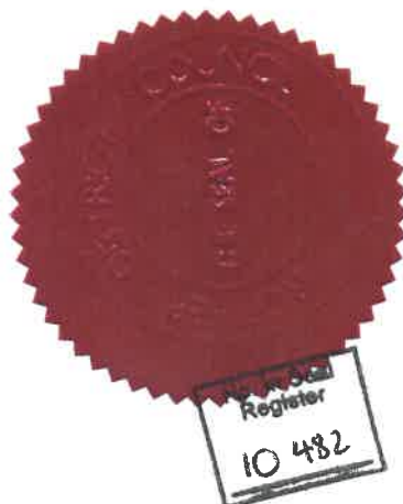
Member of the Rother District Council