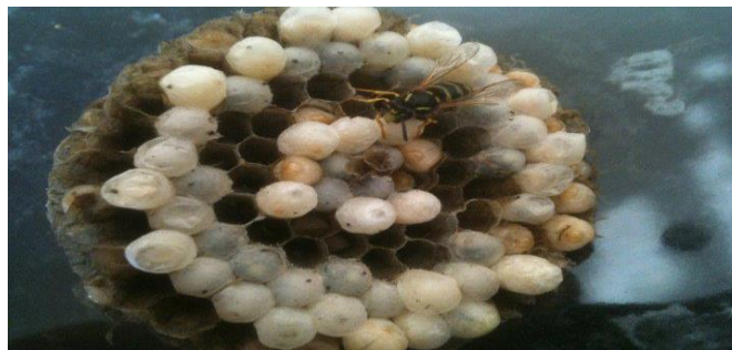
Photograph of a wasp's nest taken by pest controller

To learn more or to book a pest control treatment please goes to