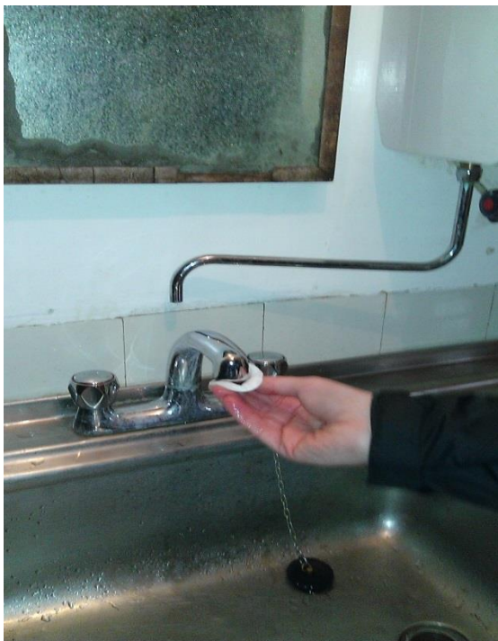
EHO Water sampling

To continue to make sure these risks are controlled the Environmental Health department will;