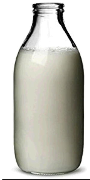
Public domain image bottle of milk

Reports of TB in a dairy herd are received from the Animal and Plant Health Agency. Our role is to check immediately that the milk is not being used for human consumption or cheese making without pasteurisation.