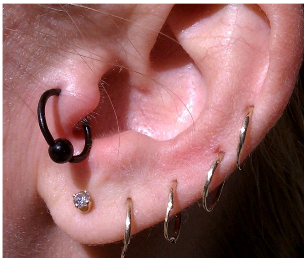
Ear piercing image in public domain

Rother DC registers practitioners who use needles to penetrate the skin for treatments for acupuncture, body piercing, electrolysis, semi permanent skin colouring and tattooing. These treatments are popular and when done correctly can give the individual satisfaction with personal appearance.