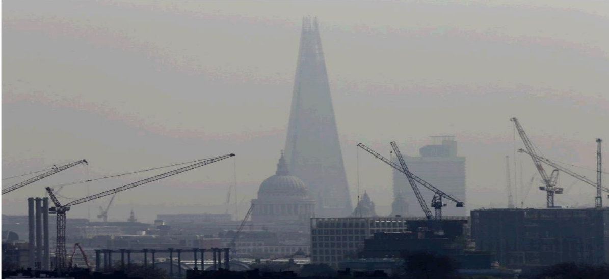
Smog surrounds The Shard and St Paul's Cathedral in London April 2017

One of the most urgent public health issues, in terms of mortality, is that of air quality. The World Health Organisation (WHO) places the mortality rate from air pollution in the United Kingdom at 25.7 per 100,000.