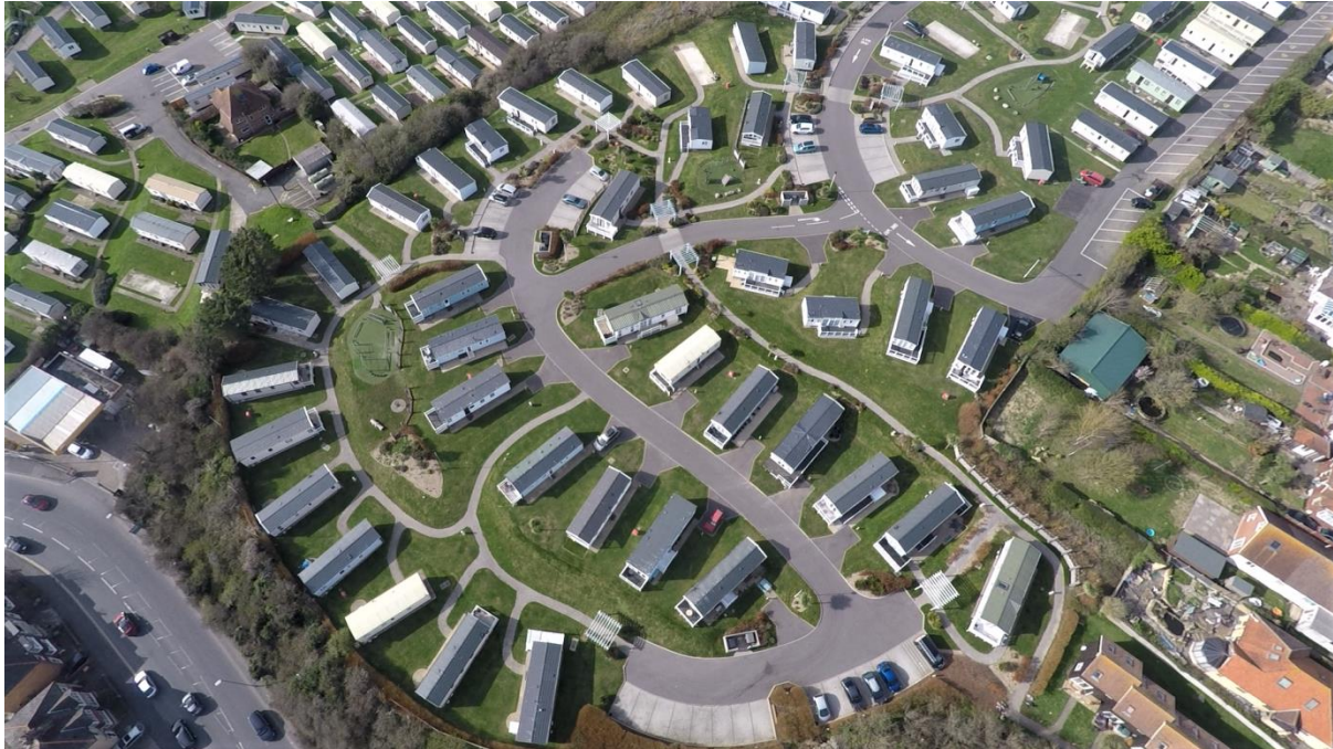
Image of well laid out caravan park

Well laid out and well managed caravan sites are a safe environment for holidaymakers and contribute to a strong local economy.