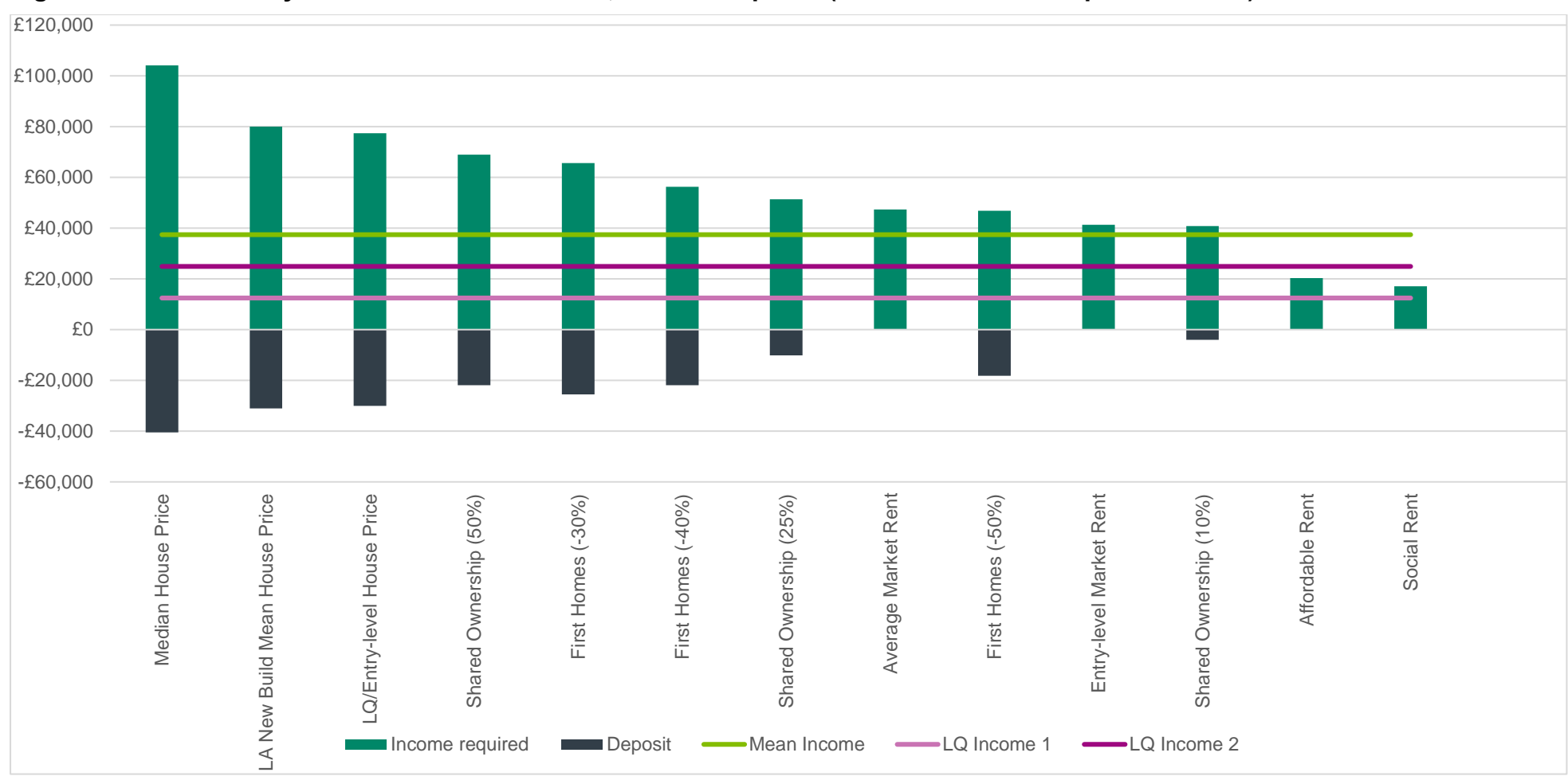
Figure 4-2: Affordability thresholds in Peasmarsh, income required (additional cost of deposit in black)