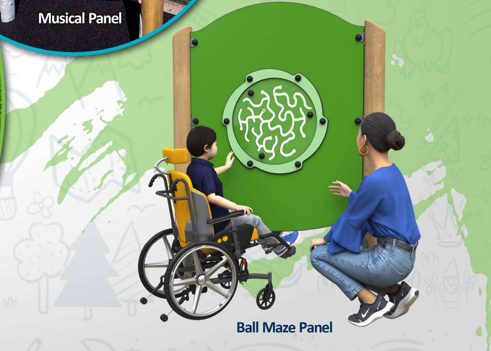
Ball Maze Panel