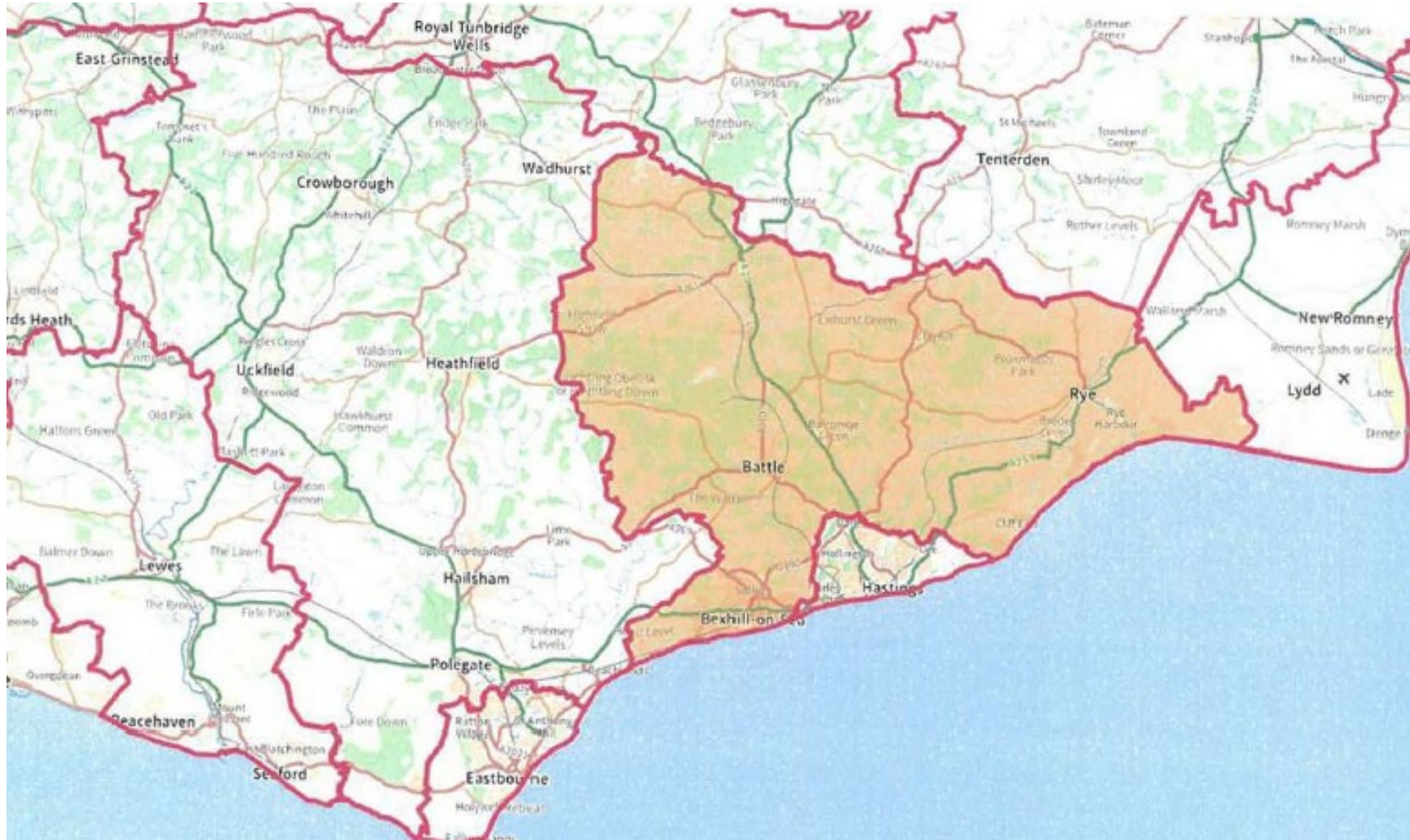
Map One-Rother District